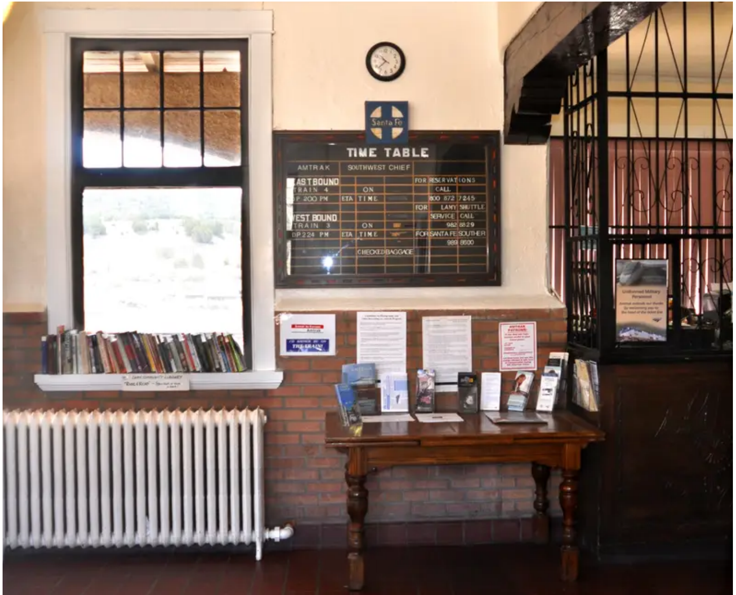
The inside of Lamy station still has elements of yesteryear, including Santa Fe signage. Most of the railroad eventually became what is known today as BNSF, a Berkshire Hathaway company.